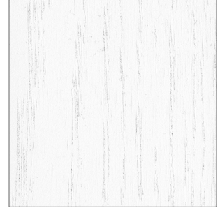
Studio Grain White