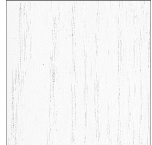
Studio Grain White